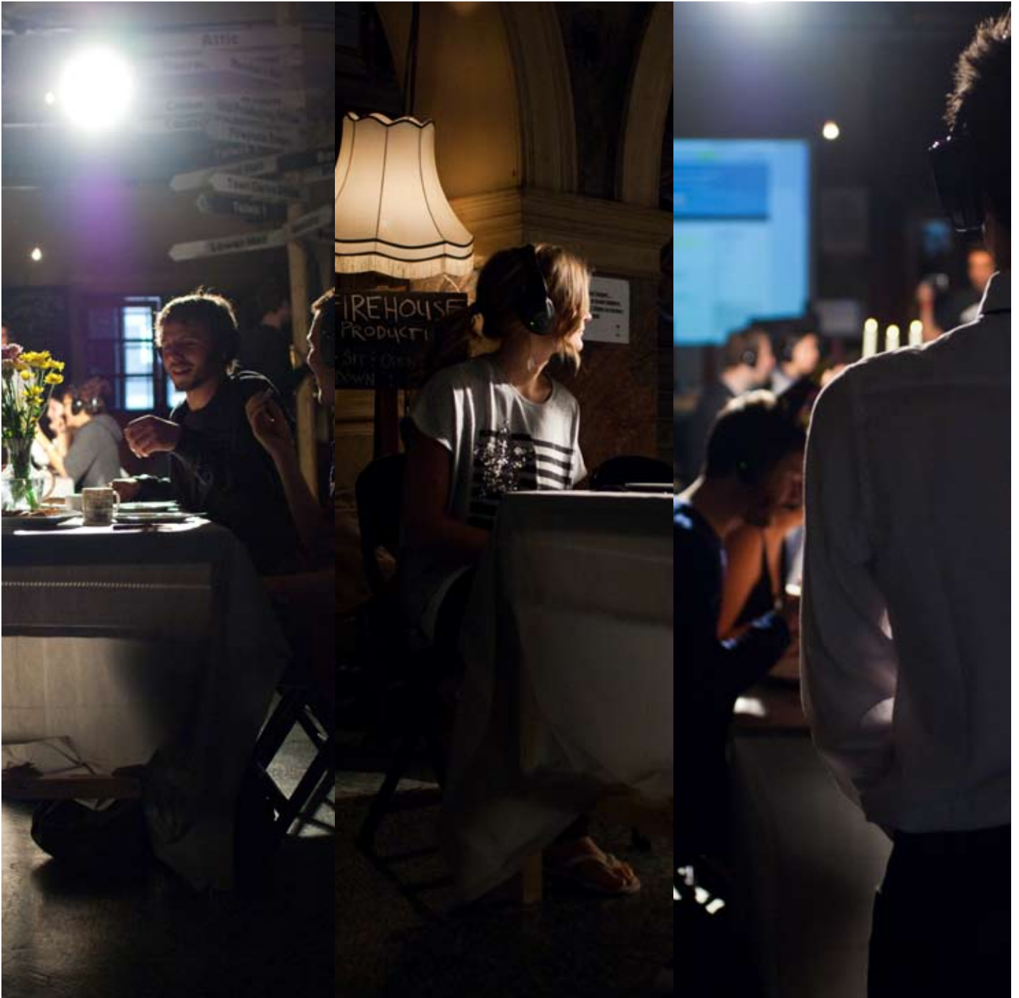
PHOTOS BY GAVIN MCKENZIE FROM THEY VOTE WITH THEIR FEET AT BATTERSEA ARTS CENTRE 26 SEPTEMBER 2009